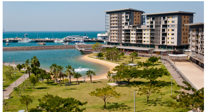
.... or booming Darwin