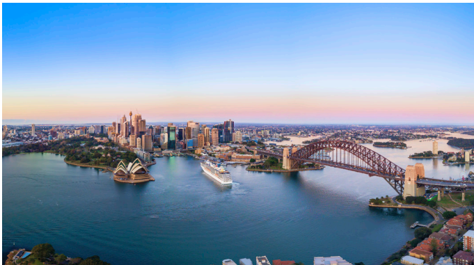
The 2012 choice: mediocre Sydney ....

What does the investor do? Her decision will impact on her financial future.