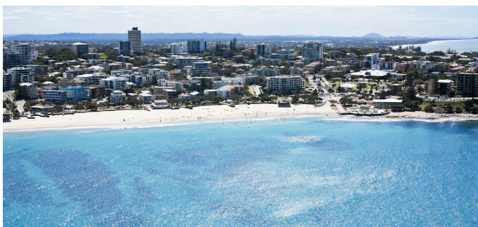
SEA CHANGE TOWN?