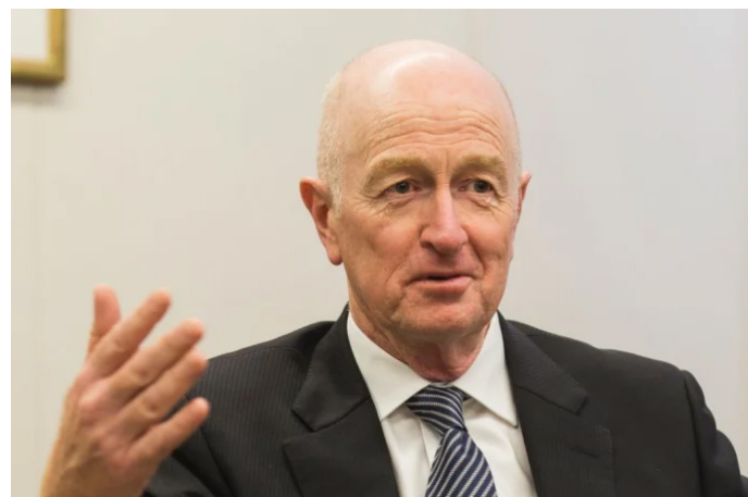
Glenn Stevens: Something he did NOT say became accepted as fact by media.

Media coverage focused exclusively on the reference to the possibility of a "hard landing" and portrayed this as being the core message of the OECD report.