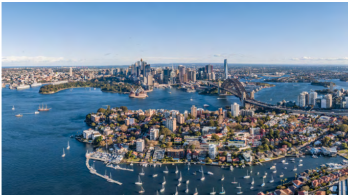
The 2012 choice: mediocre Sydney ....

What does the investor do? Her decision will impact on her financial future.