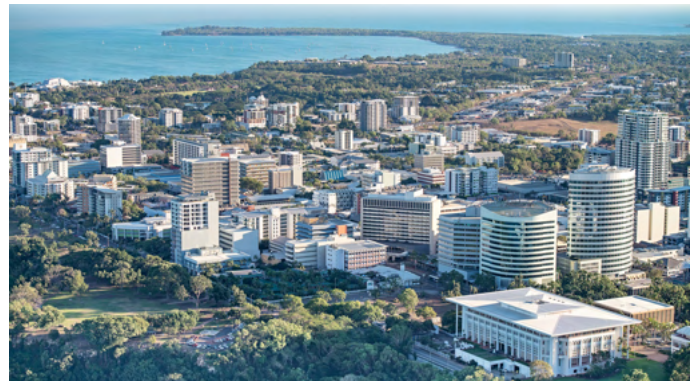
.... or booming Darwin